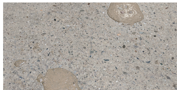
Example: Slightly overfilled mixed material installed into surface spalls.

Step 10: Grind repair flush with the surface and polish up to 400 grit to ensure color is acceptable before moving forward with repairing more spalls and cracks on the slab.