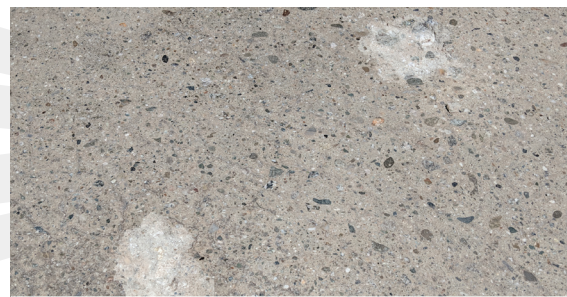
Example: Properly prepared surface spalls ready for material installation.

For long term success of any concrete repair, proper preparation of the damaged area is very important. Use a rotary hammer, joint saw, hand grinder with saw blade or a drill with a Nylox brush to abrade the sidewalls of the repair removing any loose aggregate, debris or latent material that would impair proper adhesion to the slab. Vacuum thoroughly to remove any dust left behind. DO NOT PRESSURE WASH OR AUTOSCRUB right before performing a repair. If an auto scrubber or pressure washer was used to clean the area, ensure the area is thoroughly dry before proceeding. For joint restoration, it is important to "square up" the joint by cutting out 1-3 inches from each side of the joint or as wide as necessary to ensure a solid shelf for the material to bond to and assist in supporting heavy transitional loads. When performing a joint restoration it is imperative to re-honor the original joint by cutting through the full depth of the repair and installing a semi rigid polyurea joint filler.